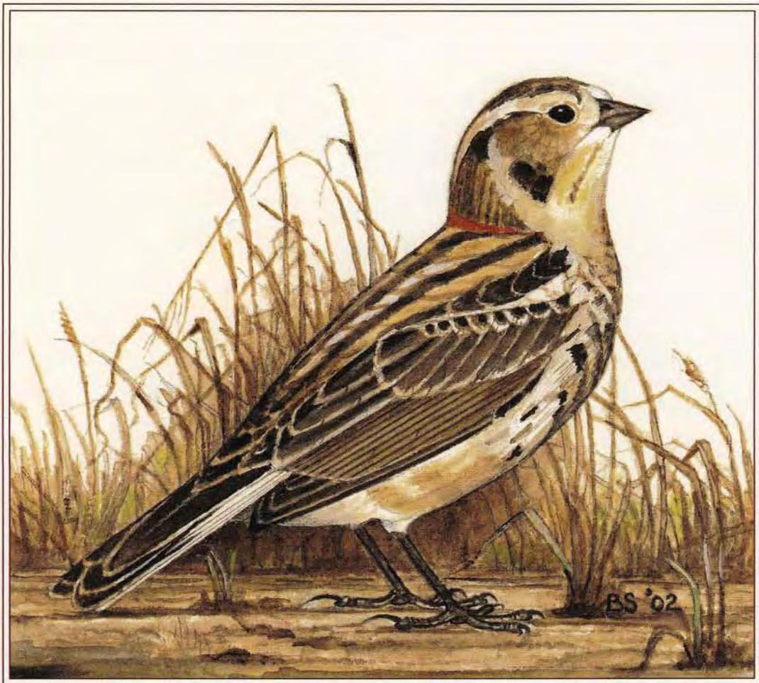
CHESTNUT-COLLARED LONGSPUR ( Calcarius ornatus )

November 16-18, 2001, south Baldwin County, Alabama Watercolor by Bill Summerour