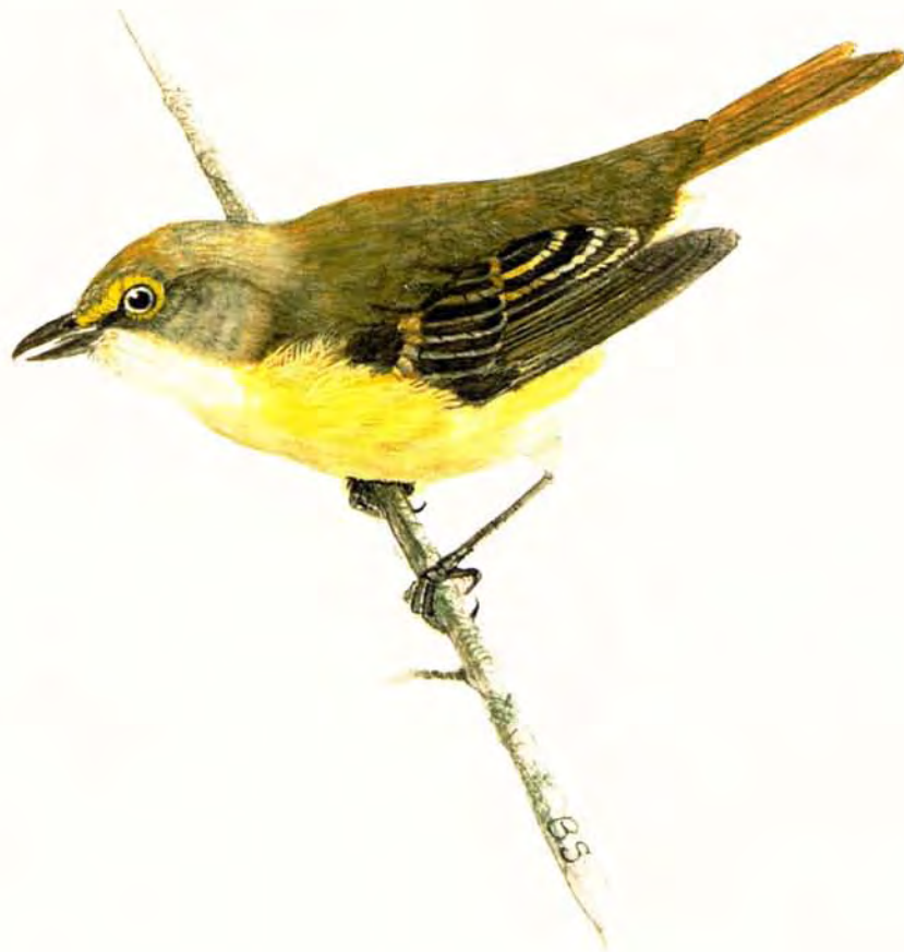
WHITE-EYED VIREO ( Vireo griseus )