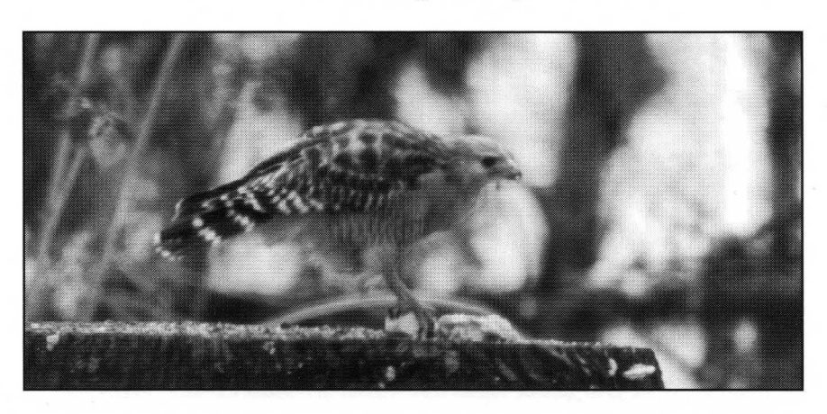
Figure 1. Red-shouldered Hawk feeding on suet at bird feeder.

For the last three years a pair of Red-shouldered Hawks ( Buteo lineatus ) has nested in some vacant woods beyond our property. Occasionally, one of the hawks could be observed perched in a tree about 50 feet from bird feeders near our house that attracts birds, chipmunks and squirrels. A swinging feeder is 15 feet from the breakfast room windows and a sweet gum stump, about 18 inches high and 31 inches in diameter, is ten feet beyond the swinging feeder and serves as an additional bird feeder.