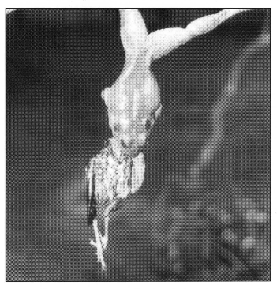
Figure 1. This large bullfrog apparently choked to death while trying to swallow a fledgling robin. The fledgling presumably drowned during the struggle.

We speculate that very early that morning the young robin had wandered too close to the water's edge or maybe had fallen into the water, and the opportunistic frog had taken it for a meal. The parents of the two fledglings were nowhere to be seen at this particular time. I had hoped the second young bird would make it to adulthood, but this did not appear to be the case when, a few days later, I found what I guessed to be the second young robin drowned in another shallow of the water garden. Such, I suppose, is nature's way. Billy F. Gilliland and Joan S. Gilliland, Route 2, Box 91-C, Empire, AL 35063.