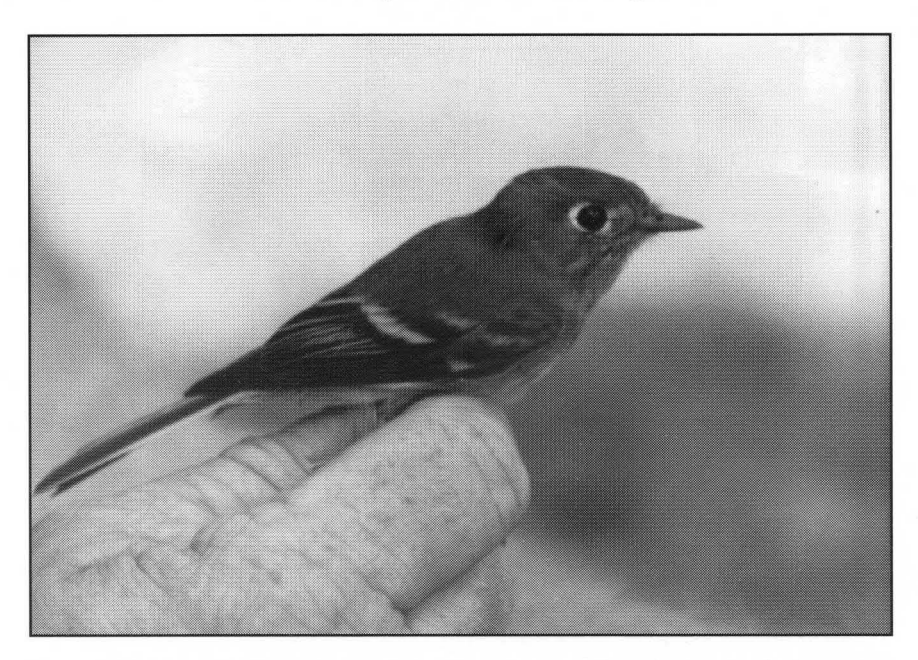
Figure 1. Hammond's Flycatcher banded at Fort Morgan.

The Study of Empidonax Flycatchers in Alabama has been difficult and incomplete. One reason for this is that all members of the genus are very similar in appearance and are notoriously difficult to identify in the field. To add to the problem, only one, the Acadian ( Empidonax virescens ), breeds in the state. All of the other five species of empids known to occur in Alabama are transients and are usually silent as they pass through on migration. Identification by voice is therefore next to impossible.